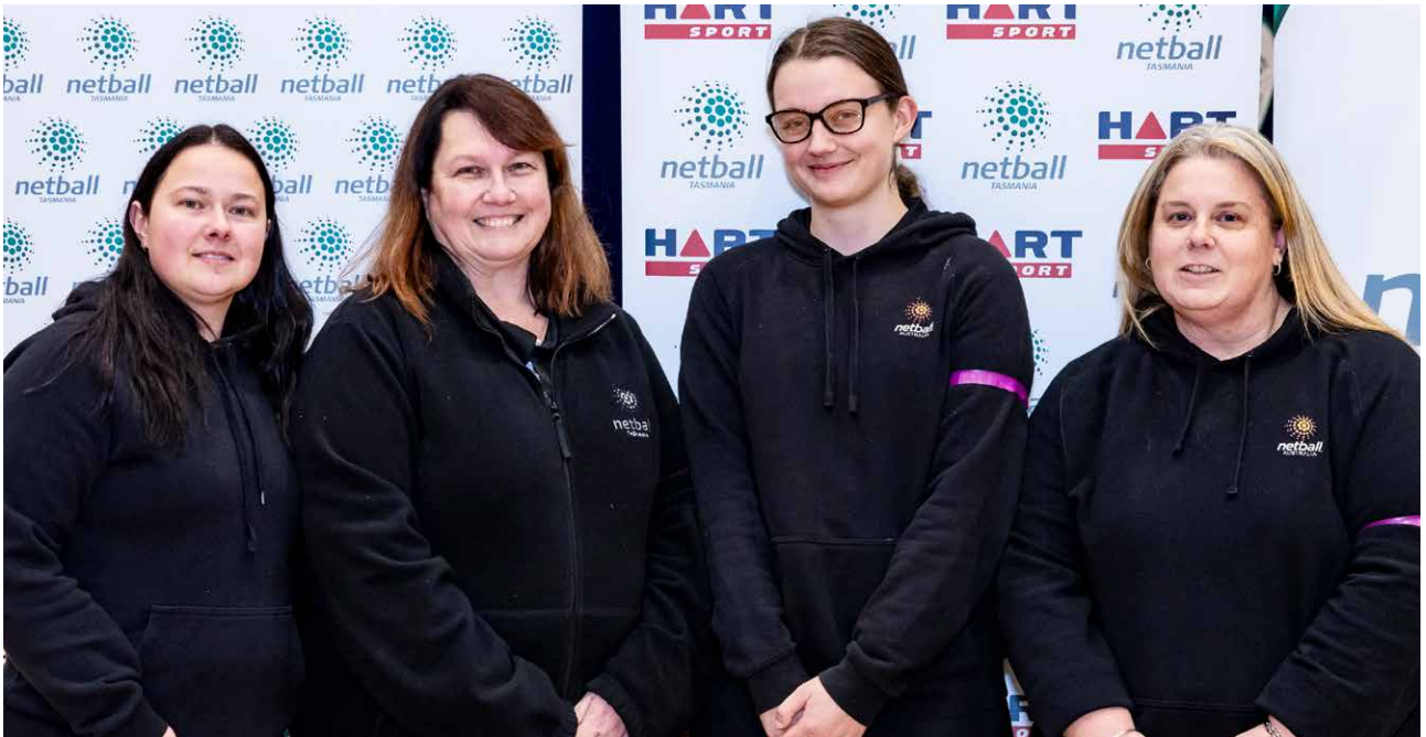
Open Grand Final Bench Officials