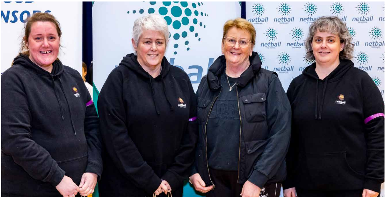
19&U Grand Final Bench Officials