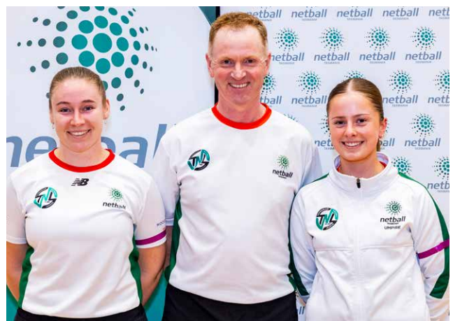
19&U Grand Final Umpires