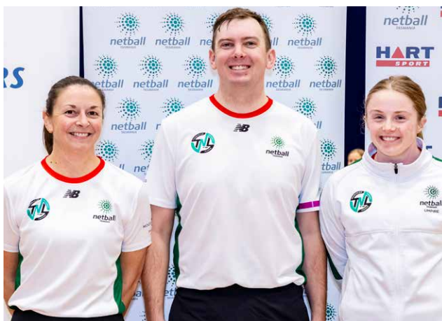
Opens Grand Final Umpires