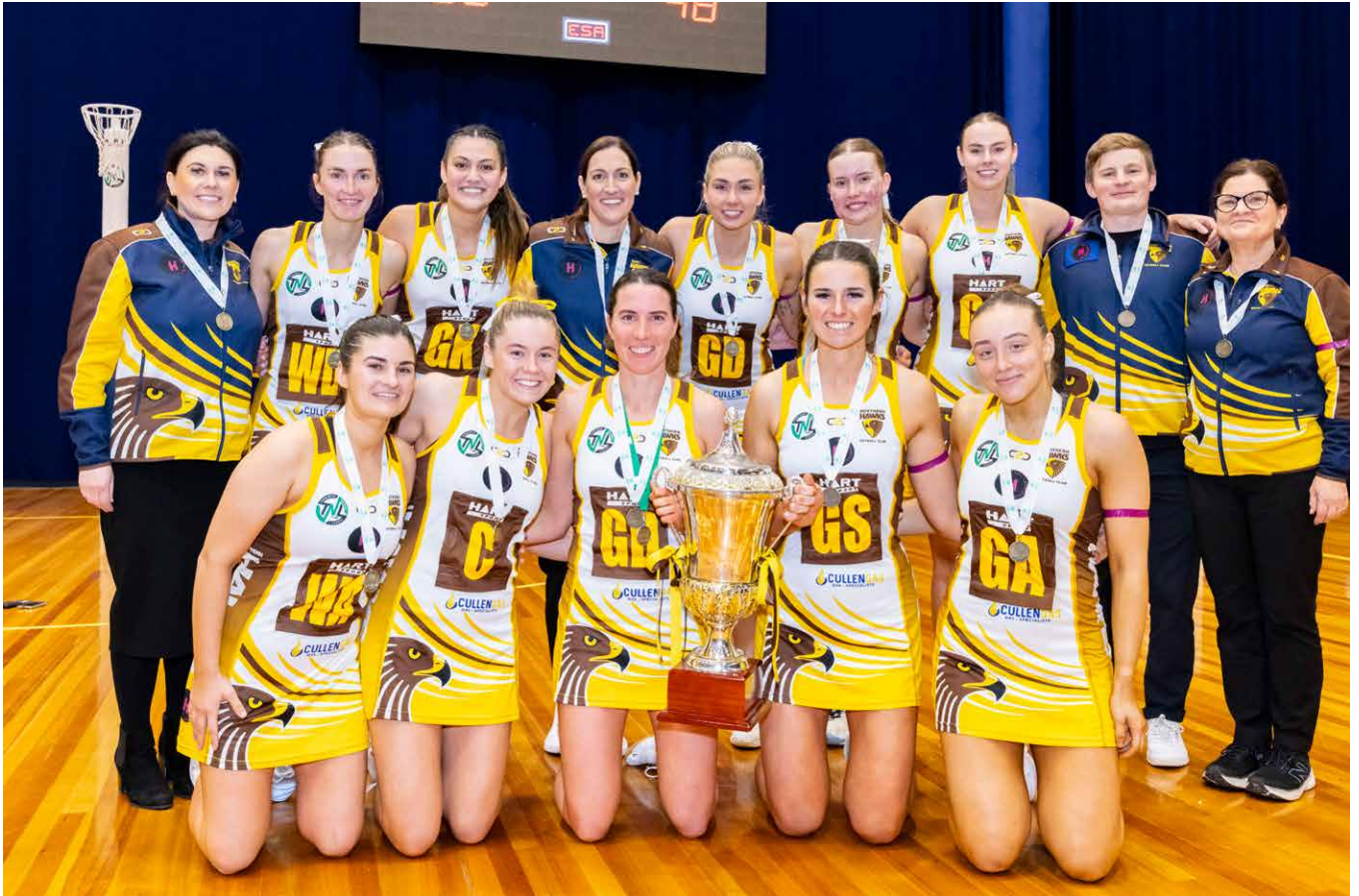
TNL Opens Premiers - HIIT Launceston Northern Hawks