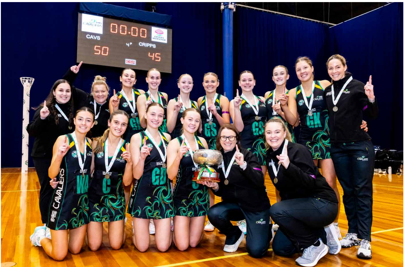
TNL 19&U Premiers - F45 Cavaliers