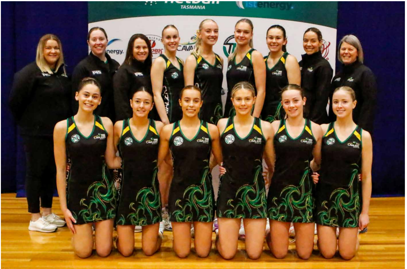
19&U 2023 1st Energy TNL Premiers Cavaliers