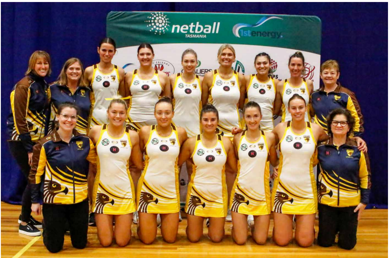
Opens 2023 1st Energy TNL Premiers - Northern Hawks